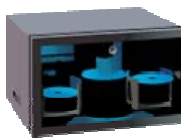
Bravo™ XRP DISC PUBLISHER