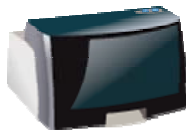
Bravo Pro DISC PUBLISHER