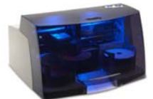
Bravo 4100 Series

Primera Technology Inc. September 20, 2011 / Revision 3.24