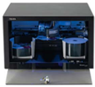
PT Burn Supports the Disc Publisher, Disc Publisher II, the Disc Publisher PRO, ComposerMAX, Disc Publisher XR and Disc Publisher XRP.