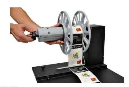
STEP 5 Insert the outer disc onto the core and screw the knob.