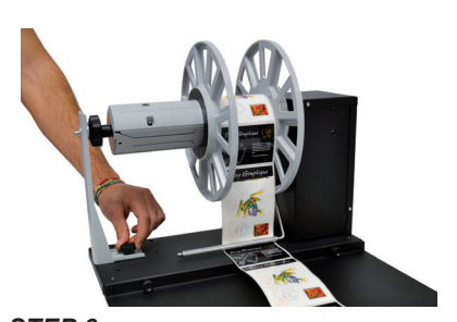
STEP 6 Install the support and fasten it to the base through the knob.