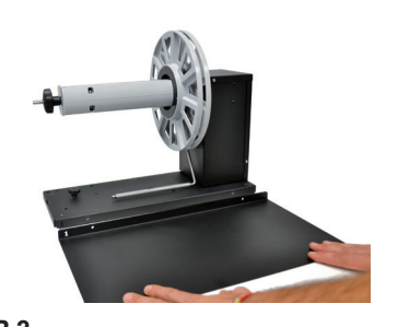
STEP 2 Set the included printer plate beside the rewinder's base.