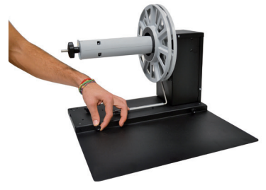
STEP 3 Use the two knobs to fasten the printer plate to the rewinder's base.