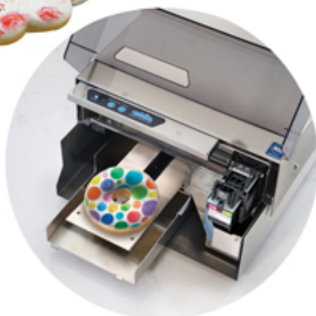
Platform Kit For items up to 2" tall