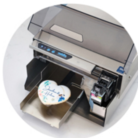
Manual Mode Carousel removed, for unique shapes