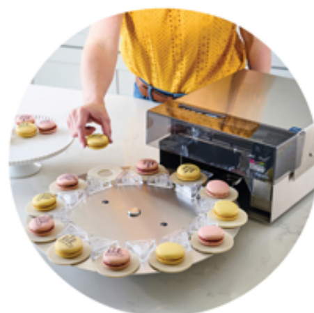
Macaron Adapter Kit Used with carousel