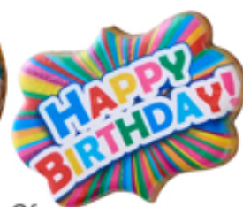
Cookies Of All shapes